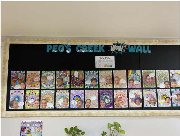
1 - TA 14's Affirmation Station