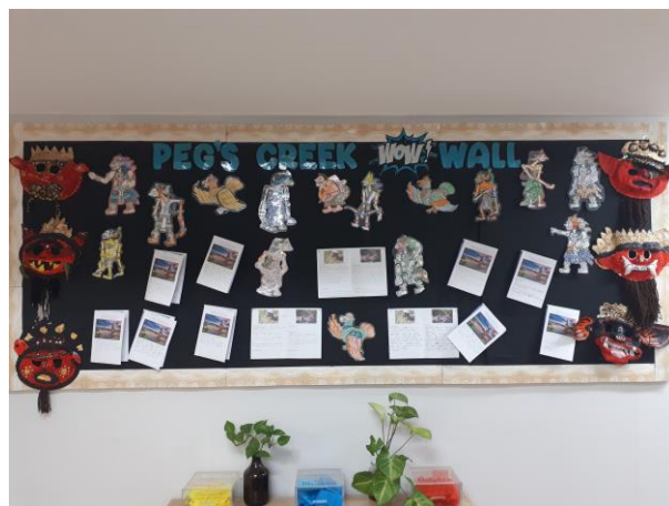
2 - Indonesian